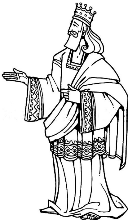
A PICTURE TO COLOUR

Q: Why was the broom late? A: It overswept