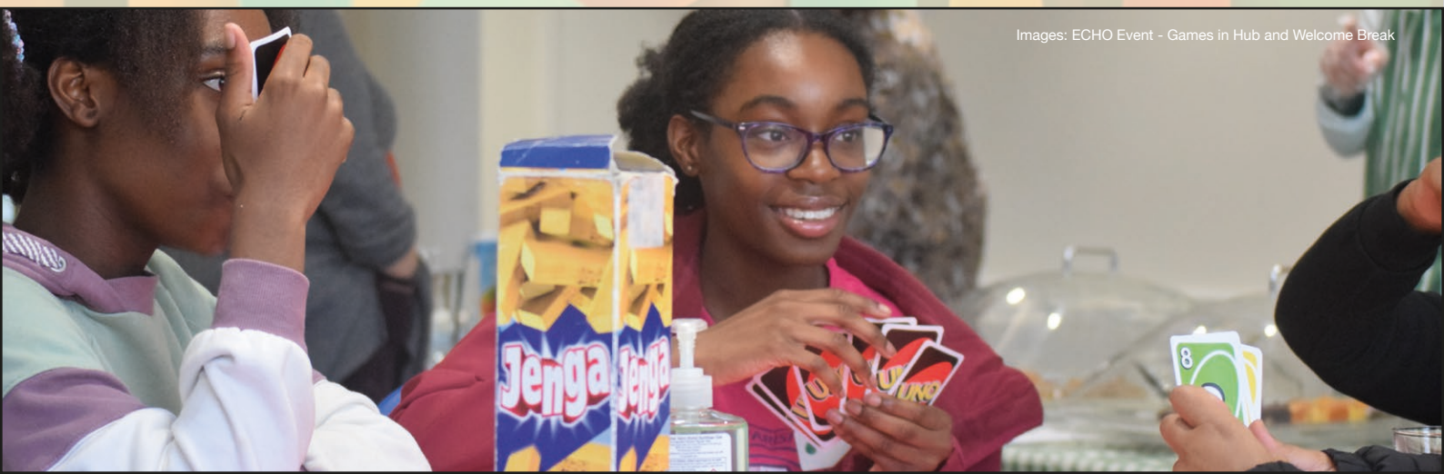
Images: ECHO Event - Games in Hub and Welcome Break

The premises are also used by a variety of community groups. We are also partnered with a church in El Salvador.