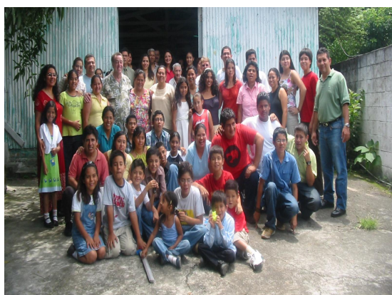
Brothers and sisters from IBECORD.