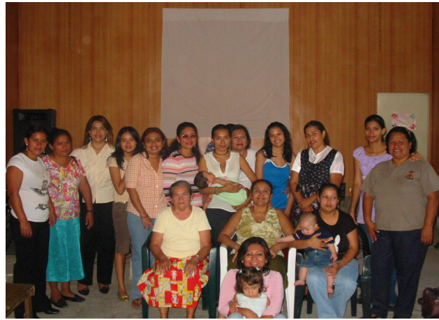
Women identity at IBECORD

Cordero de Dios Baptist Church (IBECORD Spanish acronym) has encouraged churches to be a open place to women participation. However it is only a few months ago that women from our church have started a space to reflect on gender issues in Salvadorian society and Latin American context.