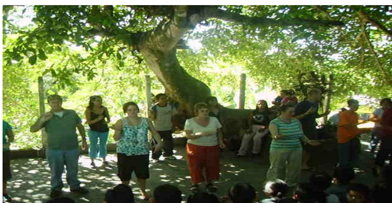
Summer Children Bible School at community El Paraíso, San Pedro.