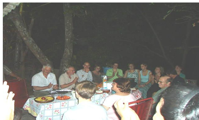
Brothers and Sisters from England, visiting a home.

We received the visit of 14 brothers and sisters from Didcot and Gildersome Baptist Churches both from England, from December 7th to 28th 2007. They were sent with the mission of contributing and animating the work of their Salvadorian sister church.