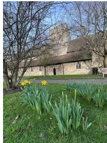
The first daffodils of spring

8pm Choral Eucharist with imposition of ashes