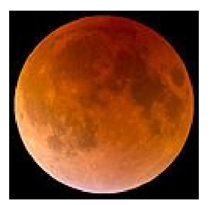
The moon on 27/28 September 2015

This phrase is again mentioned by Saint Peter during Pentecost, as recorded in Acts, although Peter says that date, not some future date, was the fulfilment of Joel's prophecy.