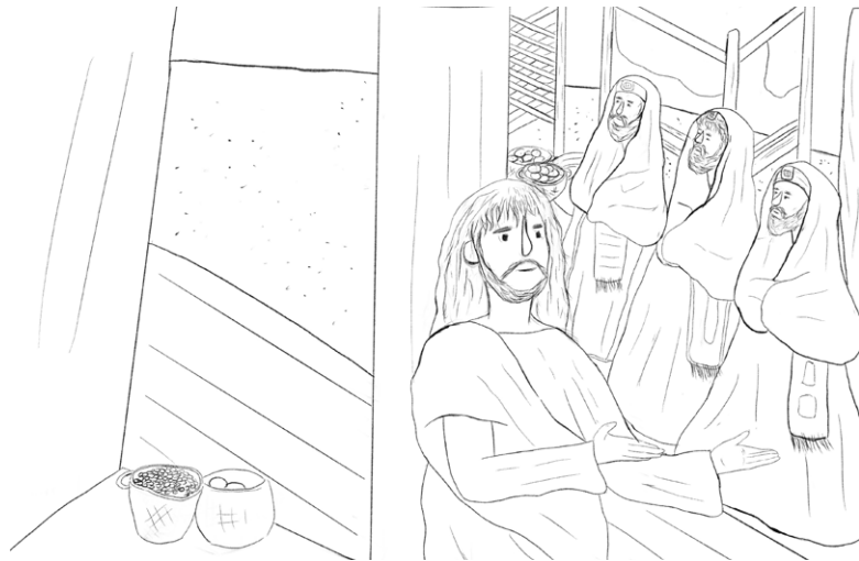
The Pharisees wanted everyone to call them 'Rabbi' (teacher).

Jesus criticises the Pharisees for not setting a good example and encourages his followers to live honestly.