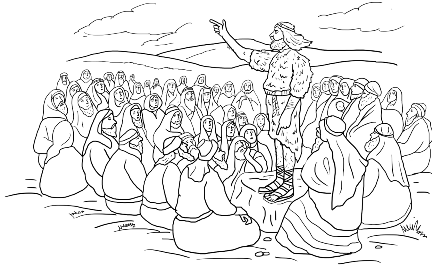
John tells the crowds about Jesus.

John prepares the way for Jesus, making it clear that Jesus will be for all people.