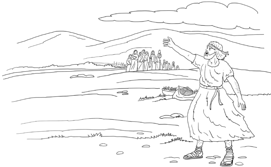
John attracted attention so that he could point people to Jesus.

John the Baptist arrives in the wilderness, urging people to repent and pointing them towards the one who is coming after him, Jesus.