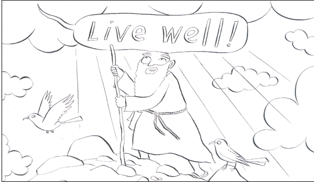
Moses hears God at the top of the mountain.