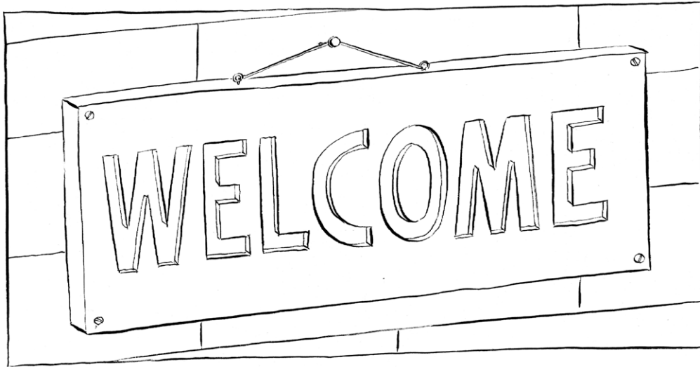
You are welcome here.

What changes are needed to make our church more welcoming? How can we help people to know that they are included? Design your own logo or slogan to show these ideas.