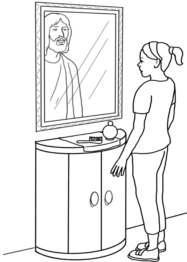
Being like Jesus is how we can see God in ourselves.

Jesus explains that all are welcome to join him in doing good and being kind to others.