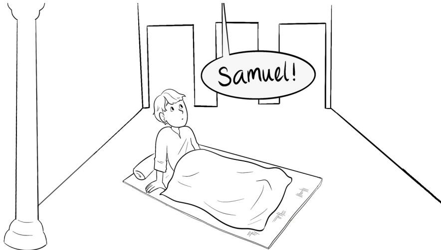
Samuel was ready to listen when God called his name.

Samuel hears a voice calling his name, and Eli helps him recognise that it is the voice of God calling him.